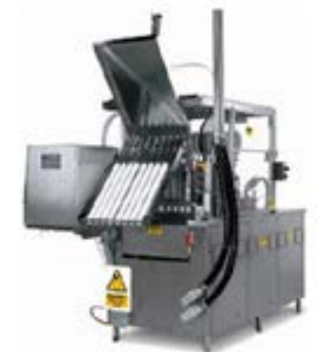
/// Packaging Equipment