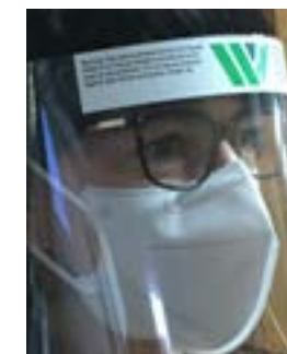
WINPAK employee wearing prototype of faceshield supplied to the Manitoba government

Spikes in consumer demand during COVID-19 put significant strain on the office and operational teams at WINPAK Division (WD) with increased order volumes and reduced lead times. Through these trying times, employees have continued to find ways to satisfy these requests from the valued customer base. In addition to ensuring customer needs were met, the WD team took on a challenge when a request was received from the Government of Manitoba to supply 100,000 protective face shields to frontline workers. WINPAK collaborated with local vendors and suppliers to prepare the face shields which were delivered to frontline medical workers in Manitoba.