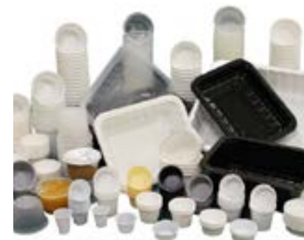
/// Rigid Packaging

WINPAK operates 12 production facilities in Canada, the United States and Mexico, offering customers global coverage and expertise. The North American business units serve customers throughout the United States, Canada and Latin America primarily to provide packaging to protect perishable foods, beverages, healthcare and industrial products. With these applications, WINPAK specializes in rigid and flexible barrier packaging as well as form-fill-and-seal machinery.