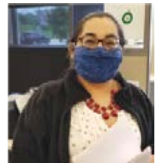
WINPAK employee wearing face mask.

While we are proud of our safety program and our safety team, an accident-free workplace is the result of continuous improvement and proactive practices. A safety culture is also built on a foundation of a shared responsibility and accountability regardless of level or job.”