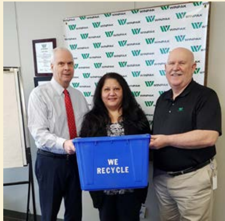
Employees from WINPAK Portion Packaging, Toronto.

Numerous examples exist within WINPAK of projects executed to reduce waste sent to landfill. These examples include the obvious such as recycling of cardboard, foil, beverage containers, office paper, batteries, etc. And there are examples of a site pushing itself to get all the way to zero waste to landfill. WINPAK Portion Packaging (WPP), Toronto is now a Zero Landfill facility, supporting WINPAK's corporate goal for all our business units to be Zero Landfill by 2025.