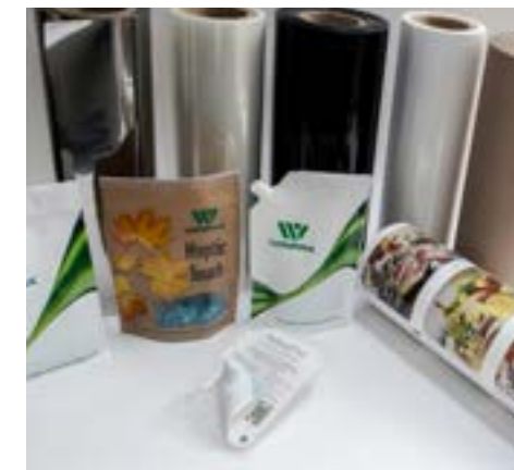
/// Flexible Packaging