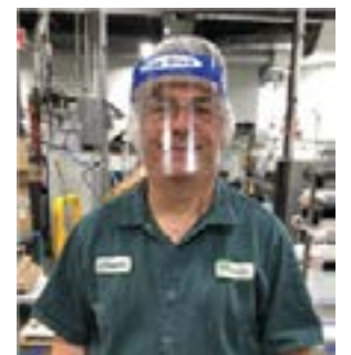
WINPAK employee wearing face shield.